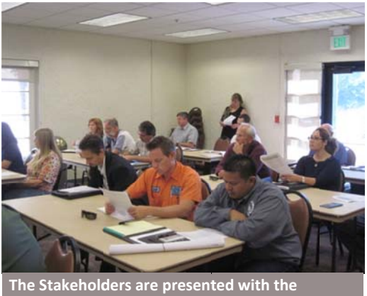
projects proposed for inclusion in the Plan

New projects must go through the submittal process. New projects selected for inclusion in the 2013 IRWM Plan Update were submitted in three ways: (1) by email using an electronic or scanned form, (2) on the www.avwaterplan.org website using an electronic form, and (3) with in-person meetings between project proponents and consultants during the Plan Updates. After submittal, the website information was updated with the assistance of LACDPW. The master list of IRWM projects (i.e., accepted into the IRWMP) is maintained on the www.avwaterplan.org website. Before projects are considered to be accepted into the IRWM Plan, they must go through the review process described below. A database of submitted projects that have not yet been